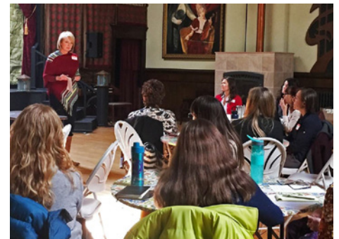
CANYON CITY, CO

While Colorado is consistently ranked as one of the healthiest states in the nation, we know this outcome isn't universally shared across our state. Many communities in Colorado face significant barriers to achieving health and well-being. The barriers – lack of affordable housing, low-wages and job insecurity, a lack of available and affordable child care, poorly funded K-12 education, food insecurity, unsafe environments, and negative attitudes and stereotypes of newcomers/immigrants, people of color and LGBTQ communities – is resulting in serious behavioral health concerns in our state. For many parents and caregivers, stress is at an all time high, which is felt acutely by all family members, especially children and youth. Without community supports and real work to address systemic barriers to health and well-being, our state will struggle in raising the next generation of healthy Coloradans.