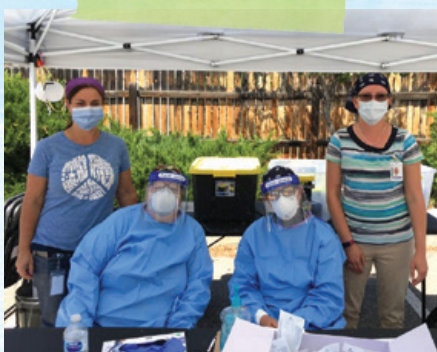
July 17, 2020 Staff members drove many miles and worked long hours to make testing "pop-ups" run smoothly.

With a rapid response grant from Caring for Colorado, Axis Health System purchased PPE and enhanced their IT infrastructure to support telehealth systems, strengthening their ability to provide primary care.