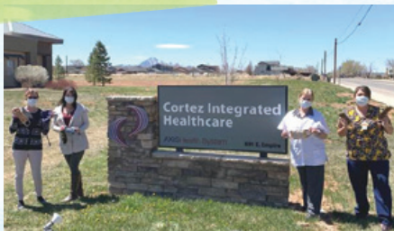
April 15, 2020 In the early days of the pandemic, staff and the public scrambled to find masks. Some people made them from scratch. Axis Health System staff at Cortez Integrated Healthcare in Montezuma County show off handmade masks donated by community members.