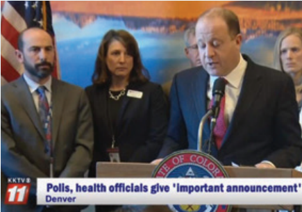
March 10, 2020 Governor Jared Polis issued an executive order declaring a state of emergency.

Throughout the pandemic, Caring for Colorado provided rapid funding and continuously pivoted to meet the changing and emerging needs of the children, youth, and families most deeply and disproportionately impacted by the pandemic – Black, Brown, and Indigenous Coloradans, seniors, people living with disabilities and people living on low incomes.