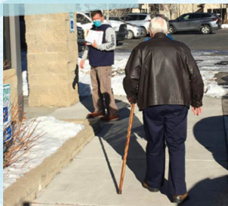
An elderly man walks in to the first vaccination clinic held for people age 70+.