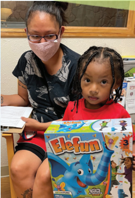
A mother and her son visit a DIFRC clinic.

HISTORICALLY, PANDEMICS tend to be particularly hard on American Indians and Alaska Natives (AI/AN), and the COVID-19 pandemic has not been an exception. The Indian Health Services reported that the AI/AN population had suffered an infection rate 3.5 times higher, a hospitalization rate four times higher, and a higher mortality rate than white Americans.