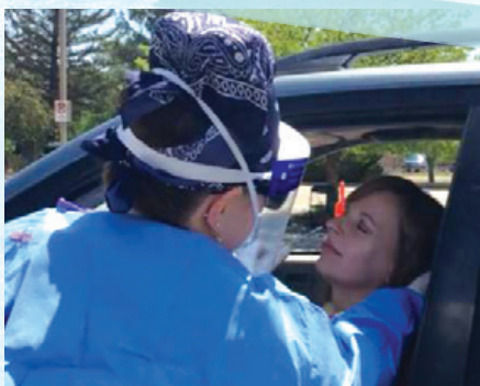
June 22, 2020 Axis began COVID-19 testing in partnership with San Juan Basin Public Health in the parking lots near Axis clinics.