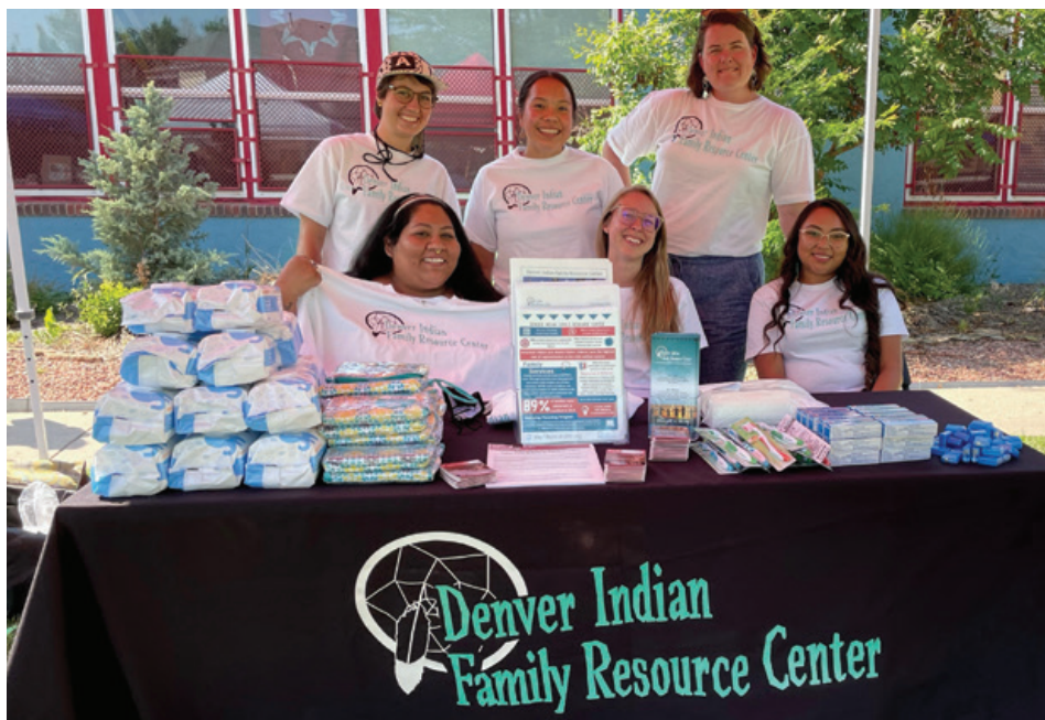
DIFRC Staff at a vaccine outreach event.