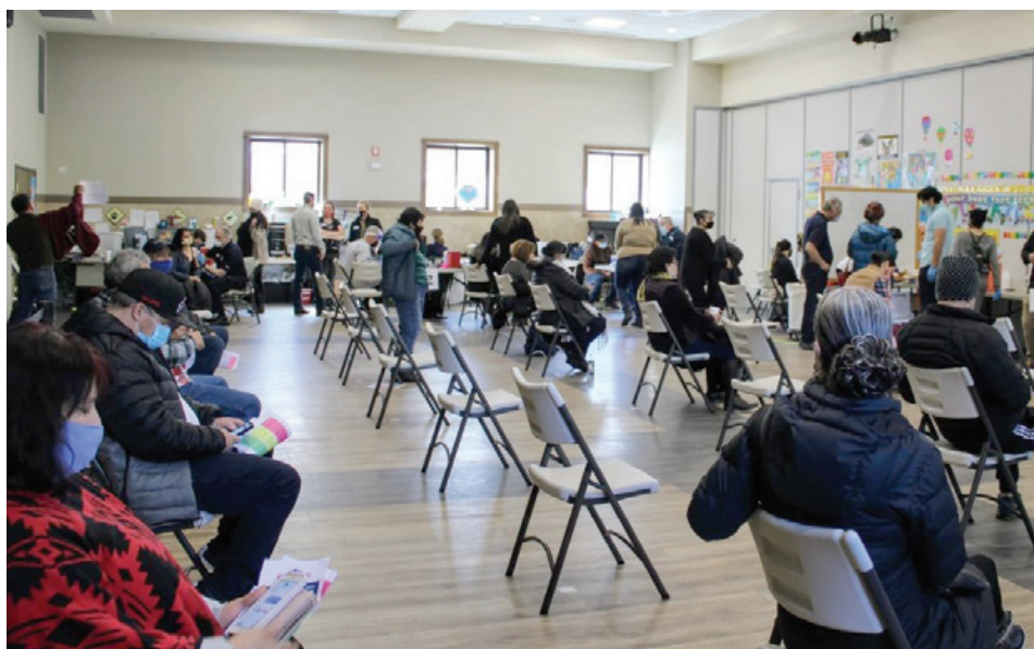
Community members gather at Voces Unidas Vaccine Outreach Event.