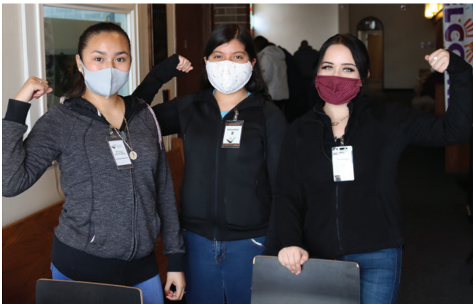
Volunteers at a Village Exchange Center vaccine clinic

“We are next to a Walmart and a Walgreens; people have access to those places, but they choose to come to the Village Exchange Center [for vaccines] because they feel safer here. Some were already participating in other programs like our food pantry, they are familiar with the people, the Natural Helpers and myself,” shared Jose proudly.