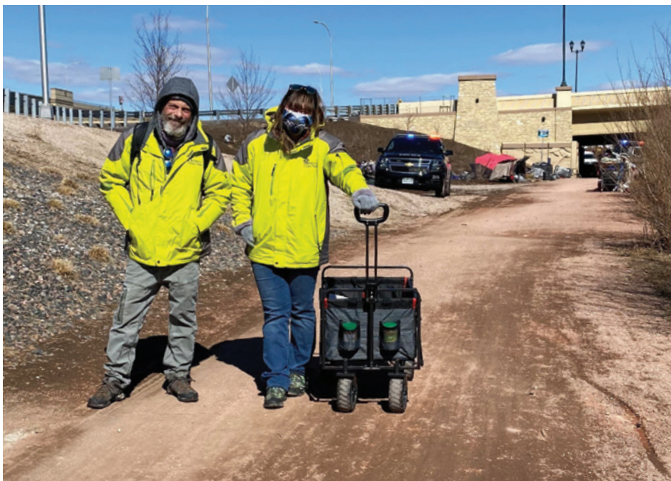
Homeward Pikes Peak Street Outreach Staff conducting vaccine outreach.

Homeward Pikes Peak received a Together We Protect grant in May 2021. The funding supported the Street Outreach Team in providing unhoused individuals with vaccine information, helping them to schedule vaccine appointments, and offering bus passes, gas cards, or rides to vaccine clinics. Jansen says there is a good bit of vaccine hesitancy among people experiencing homelessness primarily due to underlying mental health issues, fear, and a general lack of trust.