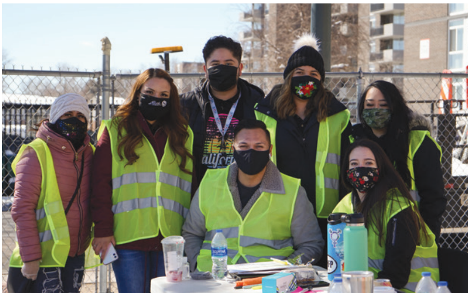
Youth Advisors at one of 11 youth-led vaccine equity projects.