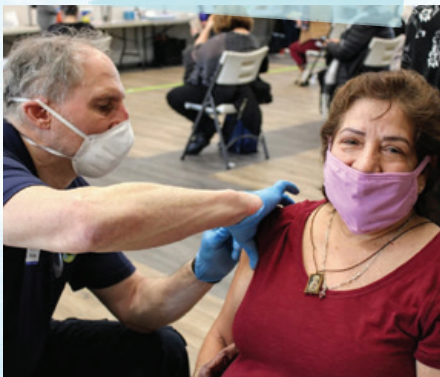
Woman receiving vaccine at Voces Unidas Vaccine Outreach Event.

Genuinely, it was the community modeling how this work should be done. It proved that community must be part of the solution, they just need the opportunity to lead.