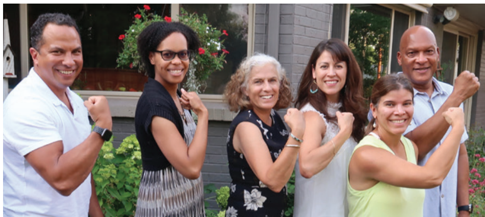
Members of the Together We Protect Advisory Group

Immunize Colorado, the Colorado Vaccine Equity Task Force, and 13 funding partners came together to form Together We Protect – Colorado’s COVID-19 Vaccine Equity Project.