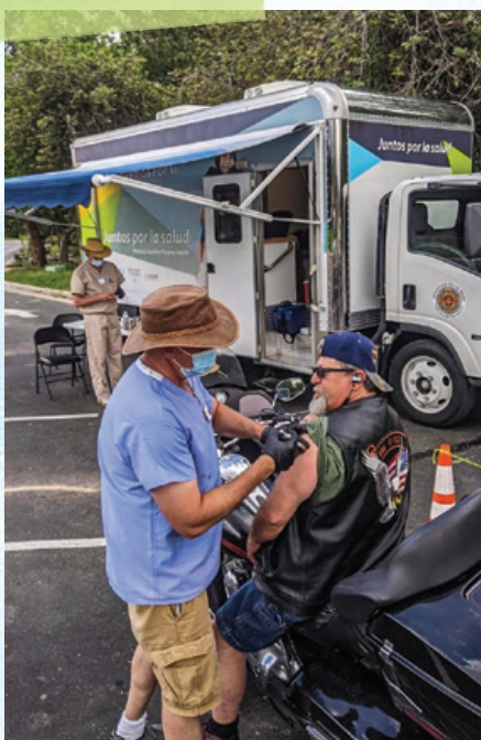
Motorist receives COVID-19 vaccine at a drive thru vaccination event led by Servicios de la Raza.

When the community is involved, we know the event will be successful.