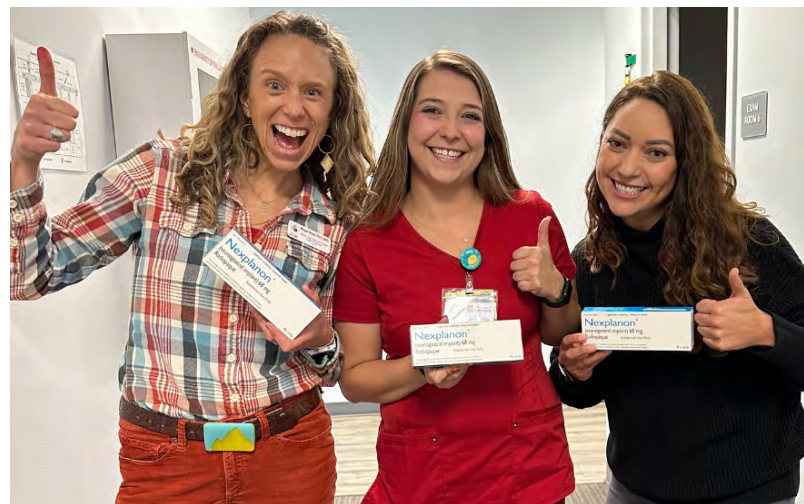
Providers in Summit County with Choose When funded methods.

This document provides a summary of the funding granted by ReproCollab and Choose When between Spring 2023 and Summer 2025.